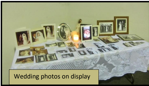
Wedding photos on display

Saturday night saw us back at the pavilion where the ladies (and some gents) excelled themselves by providing a delicious assortment of piping hot casseroles to share. Yum! Everyone had